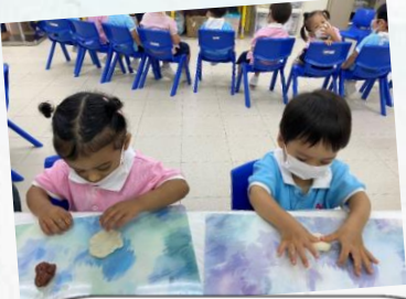
|| We're kneading the dough! ||