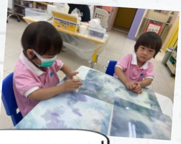
|| Do the mooncakes we made look good? ||