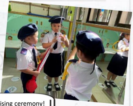
! Keep quiet during the flag-raising ceremony! !