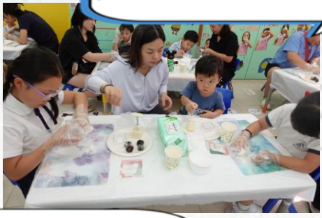
|| Making snow skin mooncakes is really fun! ||